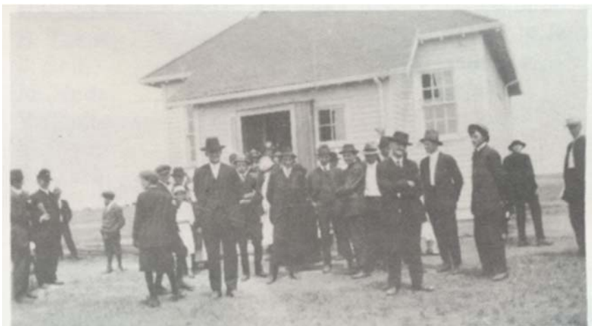
In 1918, Mennonite church services were held in the first Duchess School

The settlers came to Duchess Alberta and wanted a place to worship. They had services in the school while the church was being built.